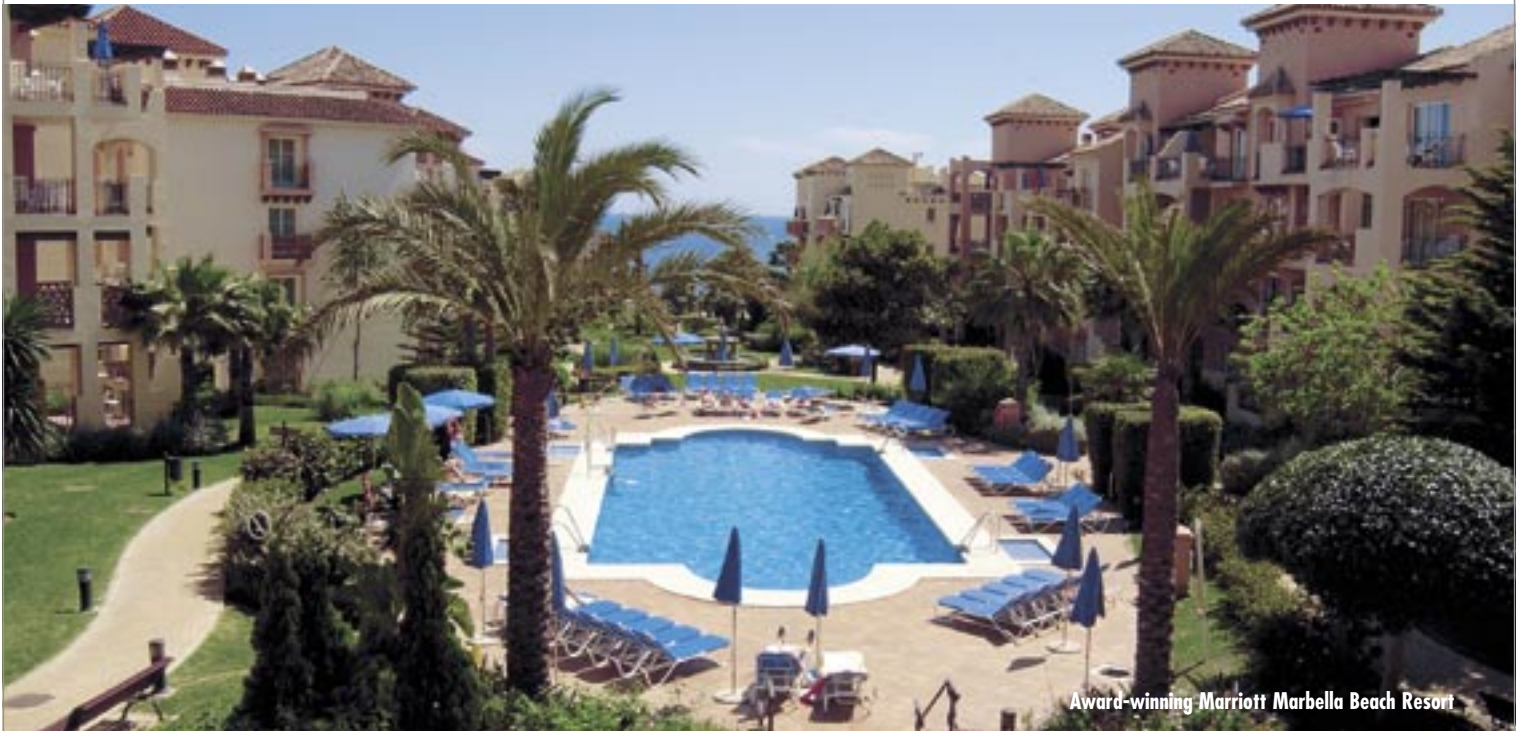
Award-winning Marriott Marbella Beach Resort

"MDCI offers clients a single point of contact," says Mark Lawson. "We take full responsibility within the framework of the services we have been contracted to provide, so effectively it's we who are in the firing line. We are no further away from any of our projects than a 20-minute drive, and we routinely have weekly onsite meetings to tie up any loose ends and keep actively on top of the whole process - it's the only way to guarantee the success our clients deserve."