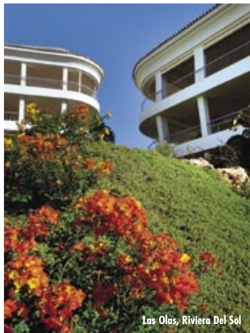
Las Olas, Riviera Del Sol