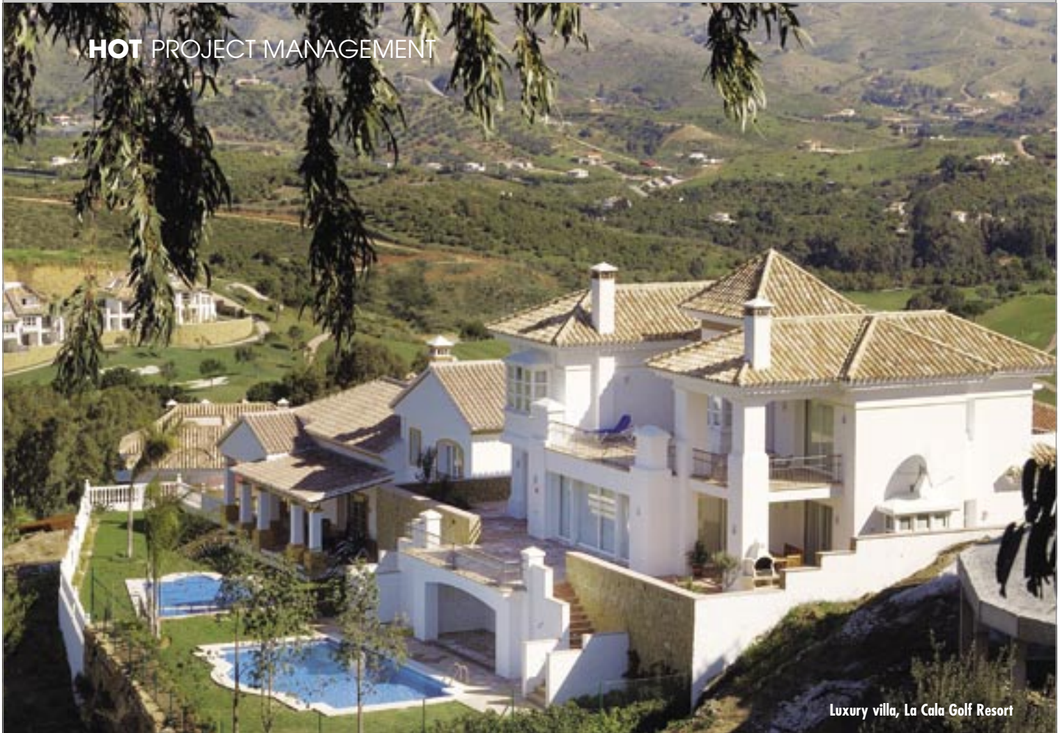
Luxury villa, La Cala Golf Resort